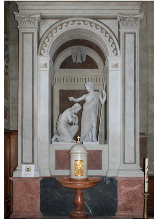
The baptismal font, in St. John the Baptist's chapel